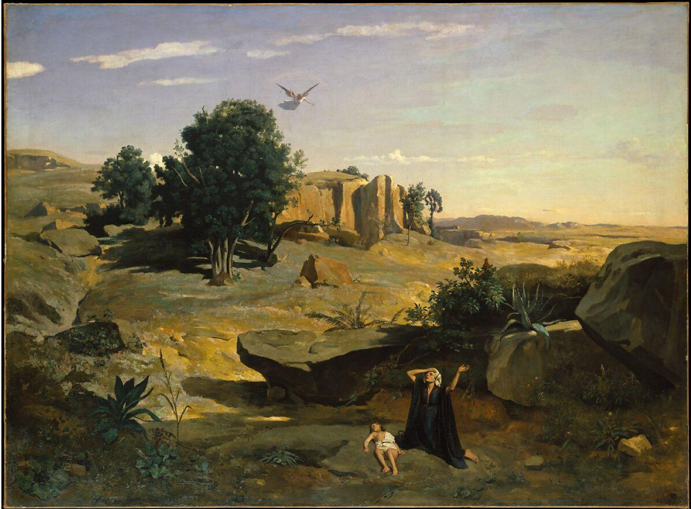
Hagar in the Wilderness, Camille Corot, French, 1835.