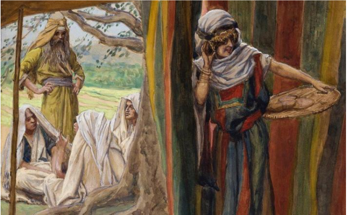
Painting by James Tissot, via Wikimedia Commons, public domain.