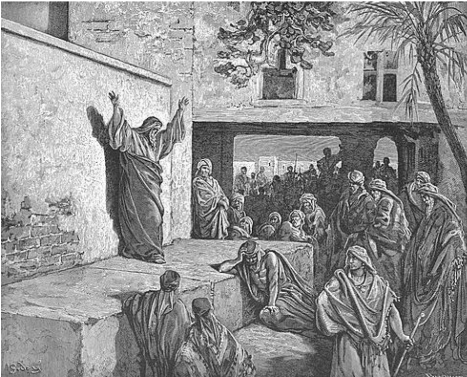
Engraving of the Prophet Micah by Gustave Doré.