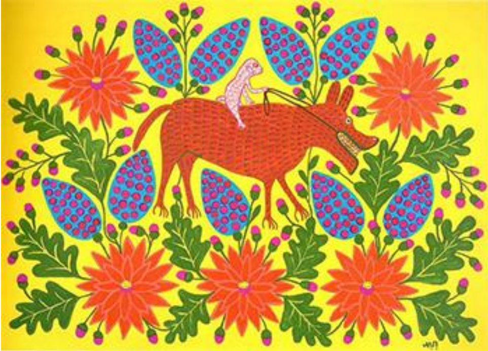
Maria Prymachenko, A Lamb Has Harnessed a Wolf (1969).