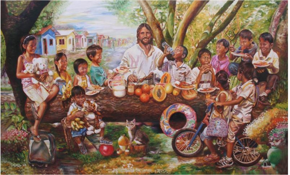
“Hapag ng Pag-ibig (Table of Love)” original mural by Joey Velasco, Filipino religious painter and sculptor