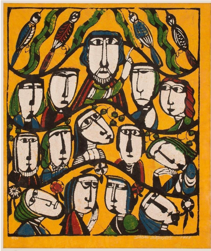
Japanese Stencil Print by Watanabe Sadao

July 6, 2025 Fourth Sunday After Pentecost 11:00am — Sanctuary