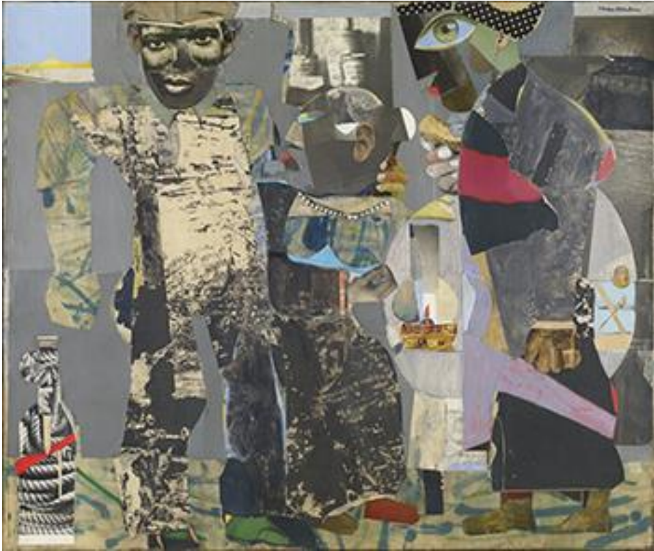
Romare Bearden, "Return of the Prodigal Son" (1967)

March 30, 2025 Fourth Sunday in Lent 11:00am — Sanctuary