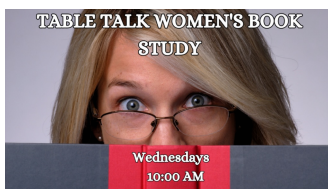
Table Talk 1 (Women's Book Study): The group meets online on Wednesdays at 10:00 am. We take turns "reading around the table", so no homework is assigned. Participants obtain their own copies of the book.

Beginning March 19, we will be reading the book The Last Week: What the Gospels Really Teach About Jesus's Final Days in Jerusalem (2007) by Marcus J. Borg and John Dominic Crossan.