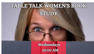
Table Talk 1 (Women's Book Study): The group meets online on Wednesdays at 10:00 am. We take turns "reading around the table", so no homework is assigned. Participants obtain their own copies of the book.