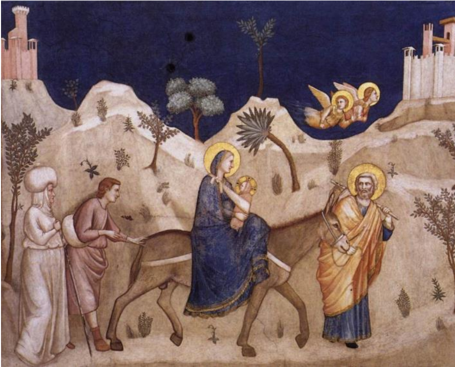
“Flight Into Egypt”, Giotto, c.1304-1306, fresco, Scrovegni (Arena) Chapel, Padua, Italy