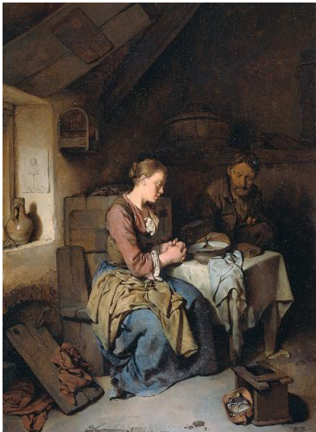
"Saying Grace", Cornelis Pietersz Bega, 1663