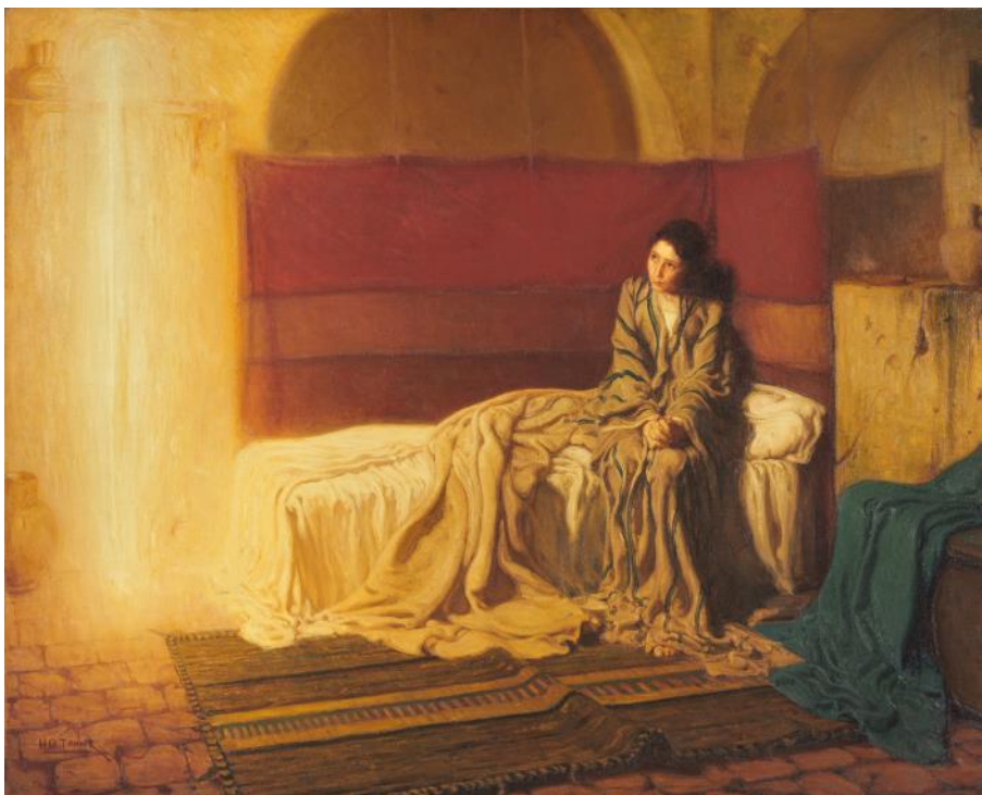
“The Annunciation” original painting by African-American artist, Henry Ossawa Tanner, 1898