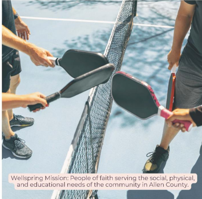
Wellspring Mission: People of faith serving the social, physical, and educational needs of the community in Allen County.

All proceeds support the mission of Wellspring bringing hope to those in need.