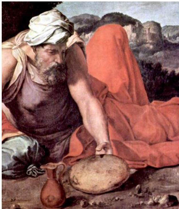
Volterra, Daniele da, ca. 1509-1566, "Prophet Elijah on Mount Horeb"