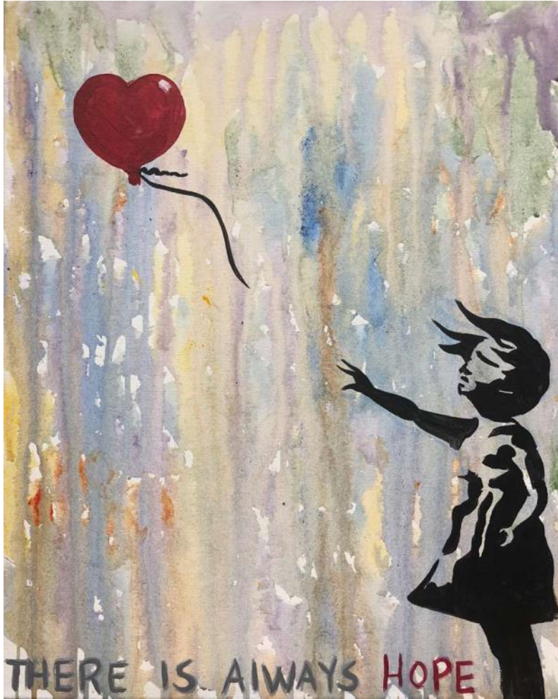
There is Always Hope , Banksy, street artist