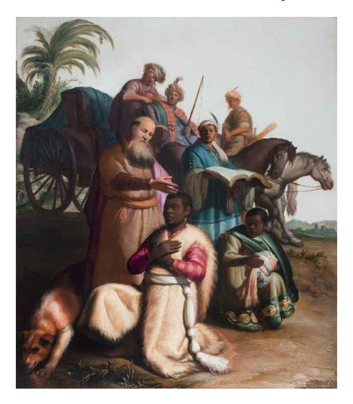
Rembrandt, Baptism of the Eunuch, 1626