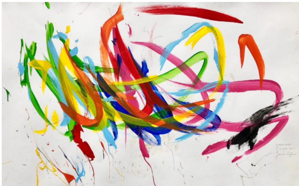
“A Happy Mind” original artwork by Picasso Acrylic on 350 grams watercolor paper