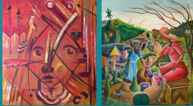
Exhibit Opens January 12 at 5:30pm with Artist Reception

Of Light and Liberty Haitian Inspired Art