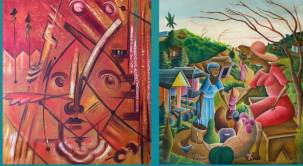
Exhibit Opens January 12 at 5:30pm with Artist Reception

Of Light and Liberty Haitian Inspired Art