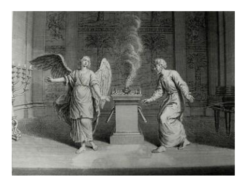
"An Angel Appears to Zechariah" Luke in the Phillip Medhurst Collection 010