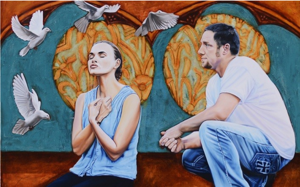
“The Annunciation”