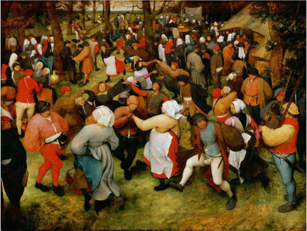
Wedding Dance, Peter Bruegel, 1566