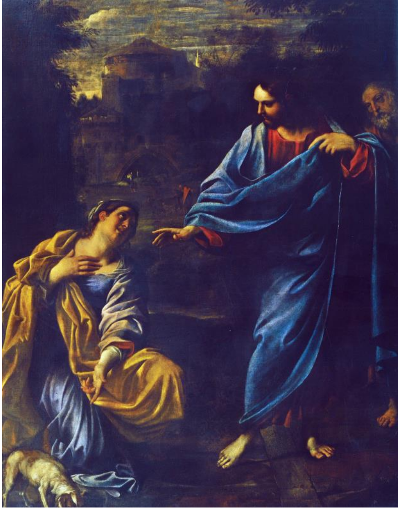
Christ and the Canaanite Woman, Annabale Carracci