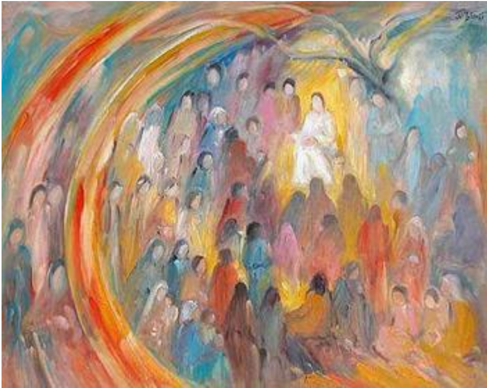
The Beatitudes , Joseph Matar, Artist