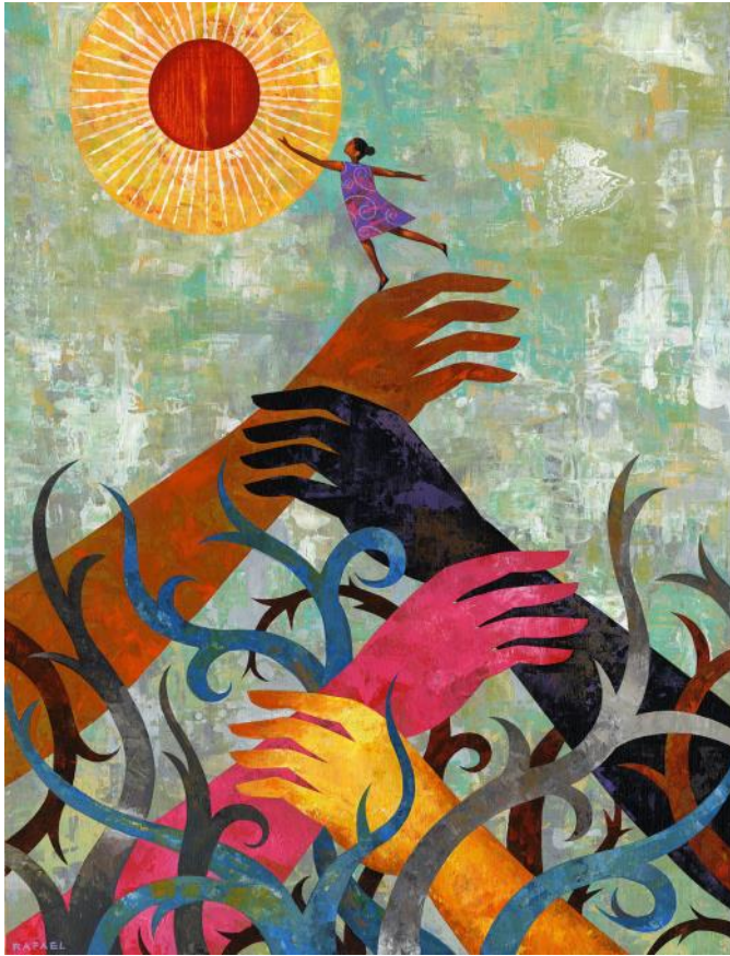
“Cooperation” by Rafael López, 2022