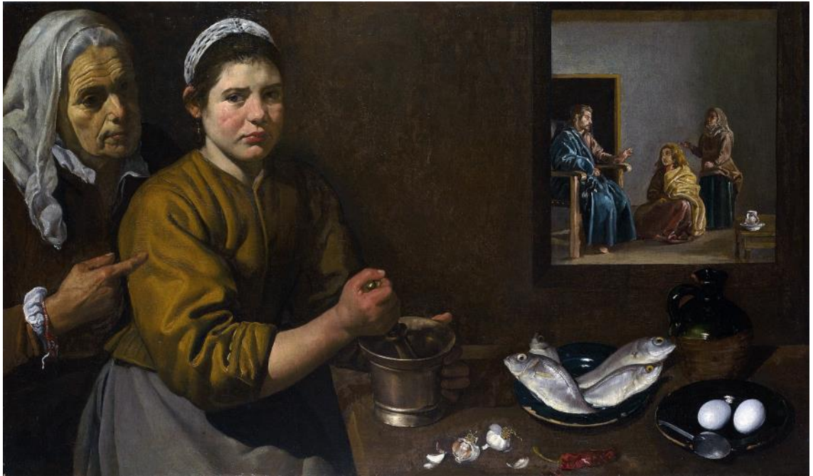
Christ in the House of Martha and Mary, Velázquez, 1618