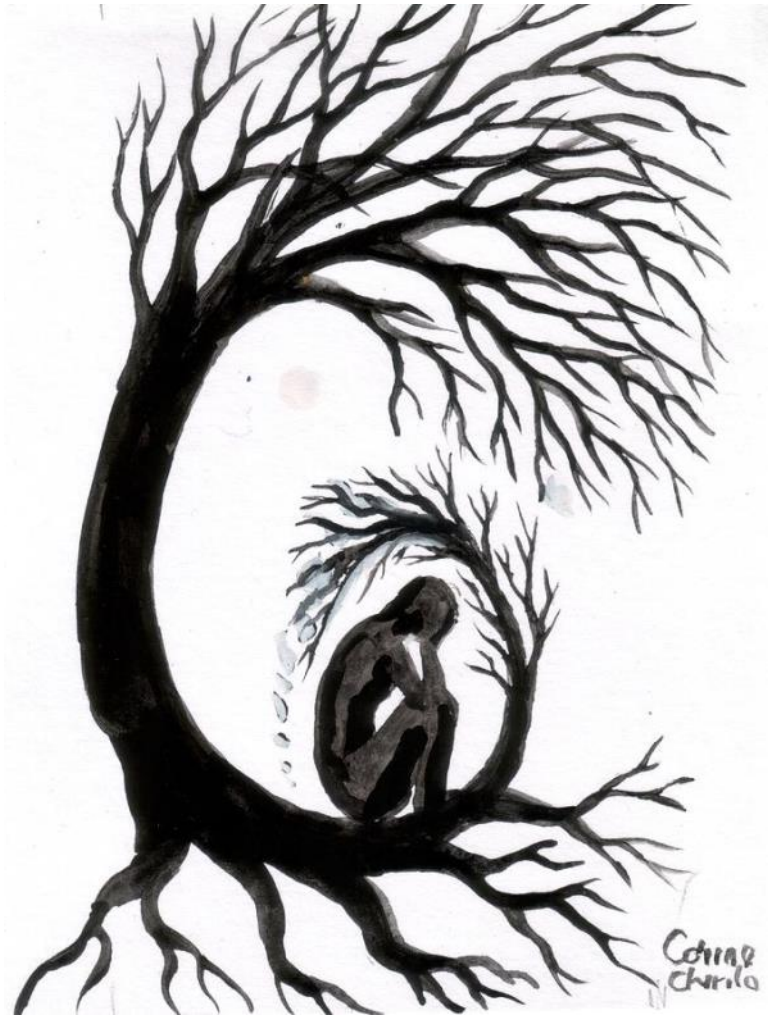
“Isolation and Depression” By Corina Chirila