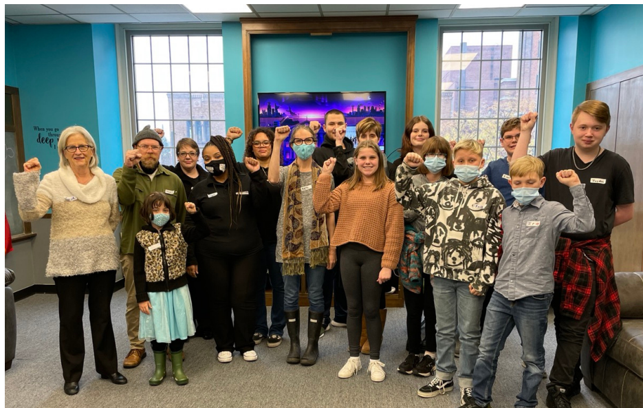
"Tough Stuff" in November

This year in Youth Group, we've been building awareness in the community, both inside and outside the church, during programming we call "Tough Stuff." Recently, our Tough Stuff session involved the self-proclaimed "Professional Radicals" of The Changemakers ( https://www.facebook.com/ChangeMakersFW/ ), a local community action group born out of the hurt and distrust arising from the murder of George Floyd.