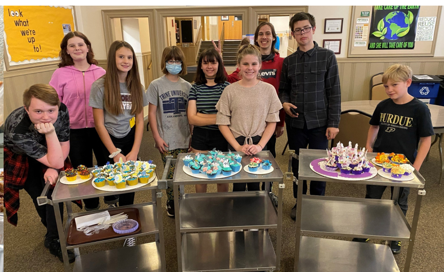
First Pres CYF: preparing food for Rescue Mission Meal (top-left), Youth Group had the first Cupcake Wars in October (top-right), at the Project 216 (bottom-right)