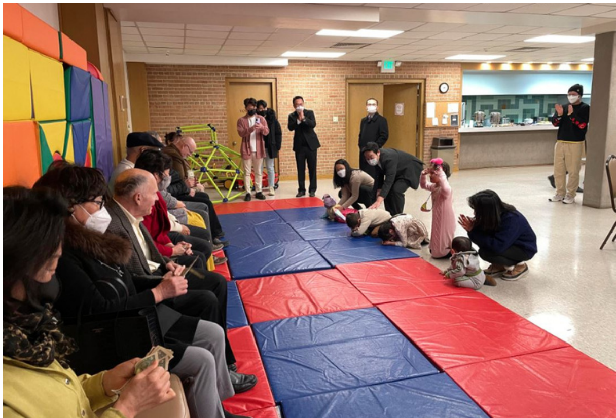
KLM: Korean traditional bow time during the Lunar New Year Celebration on January 30

The winning team was offered gift cards to Naked Tchoptix. It was a joyous, successful event in which people of different backgrounds came together to share their love for Korean culture and kick off the New Year. It was also an opportunity for those unfamiliar with Korean culture to learn more and be welcomed into a new community. Hana Klub will host 3 more cultural events in 2022 and all are welcome. If you are interested, please join our Facebook group, "Hana Klub Fort Wayne," for updates!