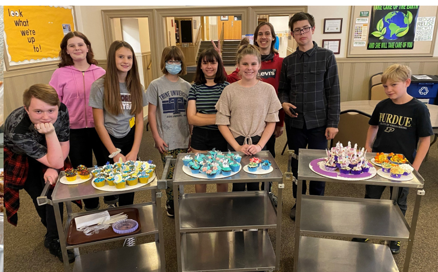
First Pres CYF: preparing food for Rescue Mission Meal (top-left), Youth Group had the first Cupcake Wars in October (top-right), at the Project 216 (bottom-right)