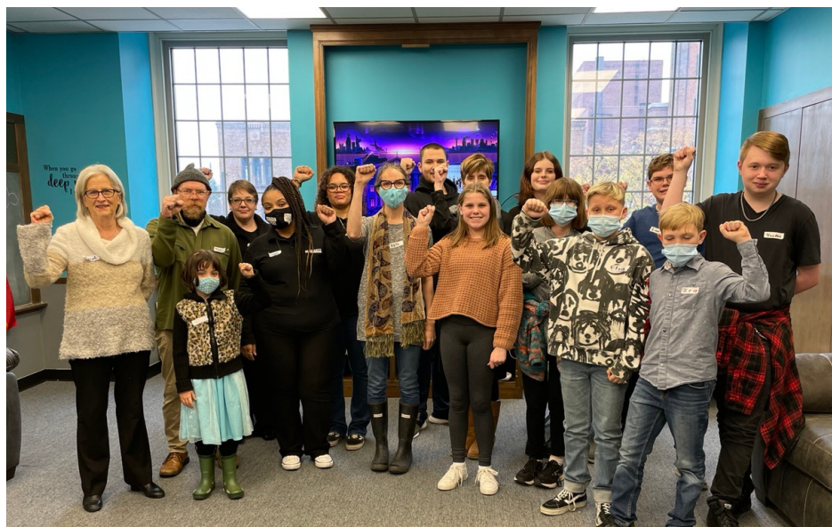
"Tough Stuff" in November

This year in Youth Group, we've been building awareness in the community, both inside and outside the church, during programming we call "Tough Stuff." Recently, our Tough Stuff session involved the self-proclaimed "Professional Radicals" of The Changemakers ( https://www.facebook.com/ChangeMakersFW/ ), a local community action group born out of the hurt and distrust arising from the murder of George Floyd.