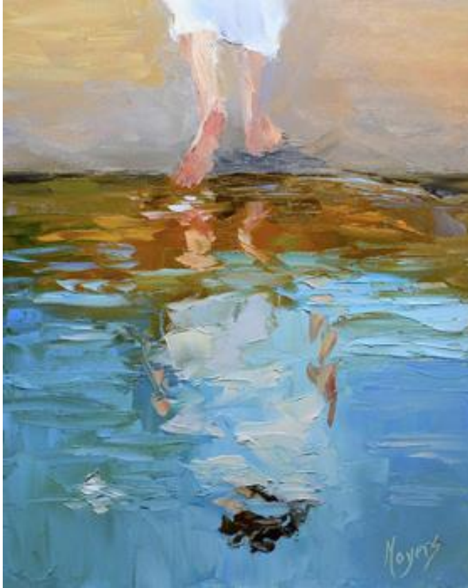
The Baptism of Jesus by Mike Moyers