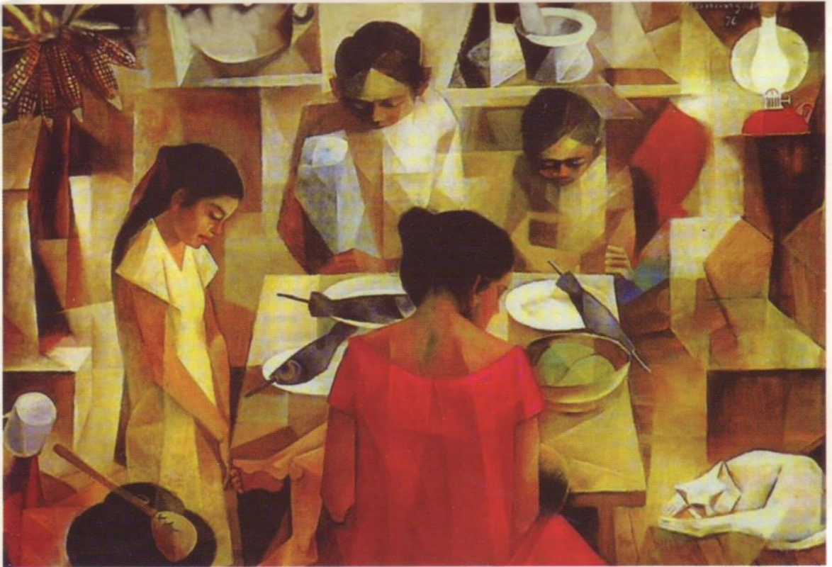
Prayer before Meal. Painting by Vicente Manansala (1910 –1981)