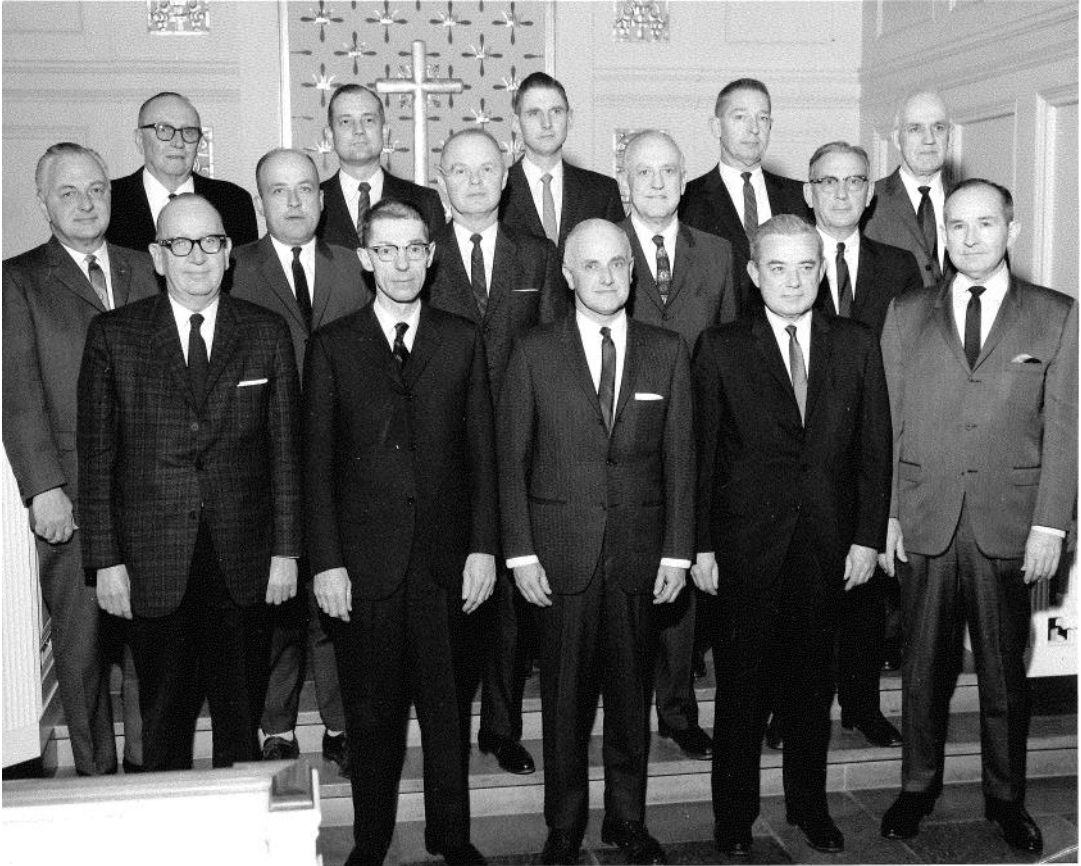
First Presbyterian Session 1965